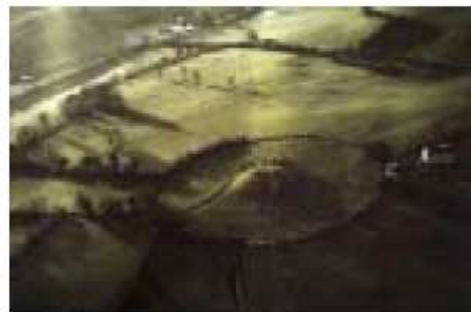
Maguire clan inauguration site (Sciath Gabhra) at Cornashee, Lisnaskea.